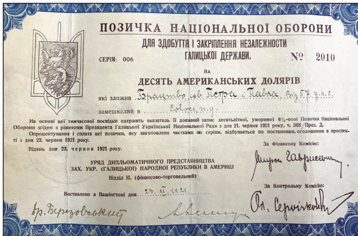
A certificate of the fund-raising campaign “Loan for national protection – to gain and retain the independence of the Galician State,” issued by the Western Ukrainian Republic Mission in Washington, DC, 1921.

Hungarian Empire was collapsing, proclaimed a free and independent Western Ukrainian National Republic. Thus Ukrainian people and Ukrainian lands, for centuries separated and ruled by different autocratic regimes, were now united into one State. But political and